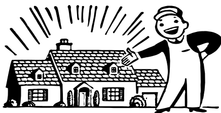
Ocoee Region Builders Association

As many of you know, the Ocoee Region Builders Association (ORBA) is a not for profit organization that is the voice of the building industry in the Bradley County area. WE provide our members with valuable services including educational benefits and representing our members before legislative bodies. Of course, these services require funding just like any other association. A few years back you may recall that ORBA held a Home Expo in Cleveland each year. Do to many circumstances, ORBA decided to cancel that event. This year I am proud to inform you that ORBA has decided to bring